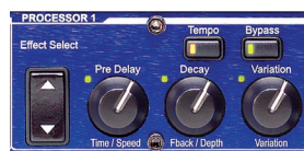
Dual Independent Controls for each Processor.

Those using the MX200 in the live arena will appreciate its intuitive front panel layout, with an Active Reverb/Effects Matrix that constantly displays which two of the 32 available effects are active, and all functions available within a single button-push turn of a knob. Dual independent processor control areas with dedicated Effects Select, Tempo, Bypass and three parameter control knobs provide instant access with precise and meaningful control over the most critical parameters for the selected effect. Parameter change LEDs illuminate to indicate any change from the 99 meticulously crafted Factory or 99 User Programs. Choose from five digitally-recorded audio samples to Audition the selected effects.