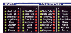
Active Reverb/Effects Matrix displays which two effects are active at all times.